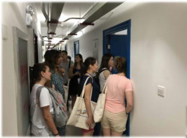
Visiting the International Student Dormitory of BNU