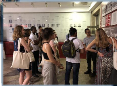
Visiting the Yingdong Bldg. & Visiting the History Museum of BNU