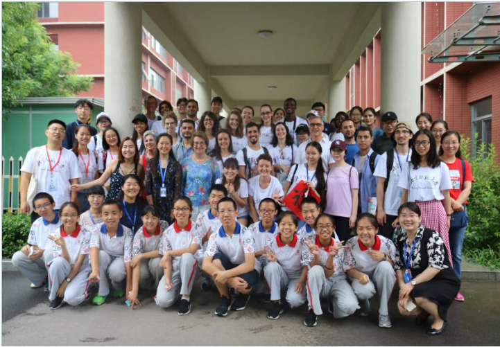
Visiting the Changping School Attached BNU