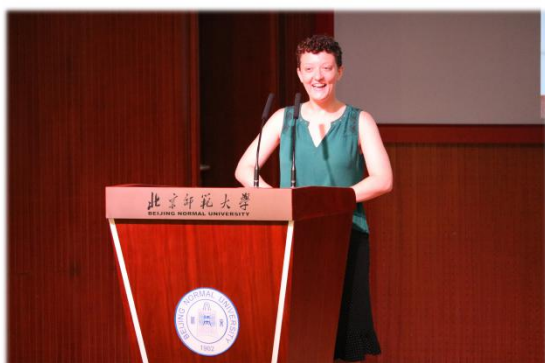
Speech by student representative