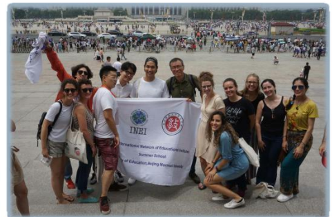
Visiting the National Museum of China