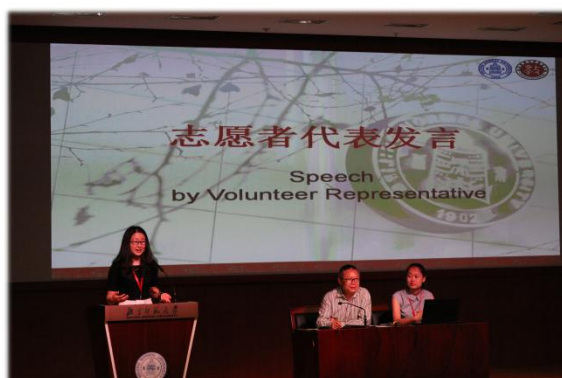
Speech by volunteer representative